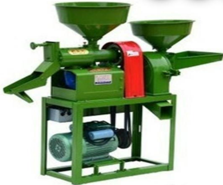
Combined Mini Rice Mill

Operating Type Automatic Brand: Heavy Tech Usage: Domestic Operation: Powered Power Source: Electricity Connection: Single Phase 220V, Motor: 3 Hp Production Capacity: (Depend on Worker Speed) 1 year warranty