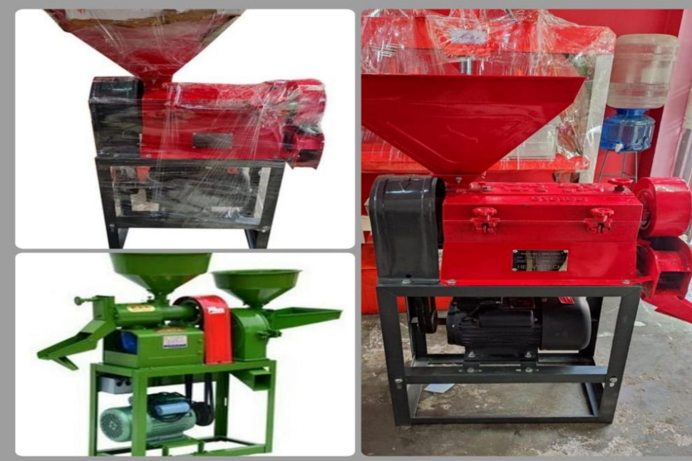
Mini Rice Mill

Operating Type Automatic Brand: Heavy Tech Usage: Domestic Operation: Powered Power Source: Electricity Connection: Single Phase 220V, Motor: 3 Hp Production Capacity: (Depend on Worker Speed) 1 year warranty