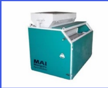
Automatic Destoner Machine