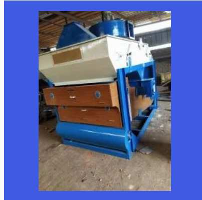
Paddy Cleaner Machine