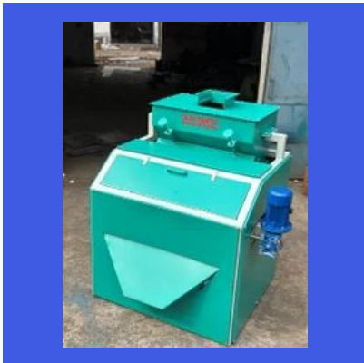
Magnetic Destoner Machine