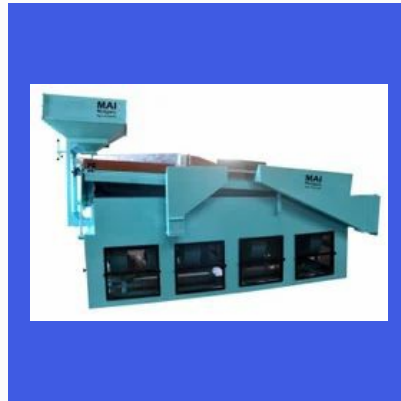
Gravity Separator 7 Fan