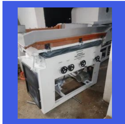
3 Fan Gravity Separator