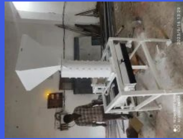
Cigarette Recycling Machine