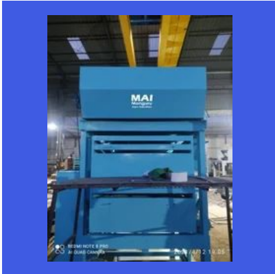
Rice Cleaning Machine