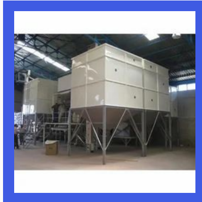
Grain Storage Tank