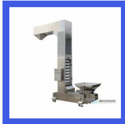
Z Type Bucket Elevator Machine