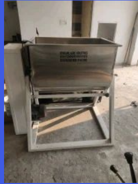
Pickles Mixing Machine