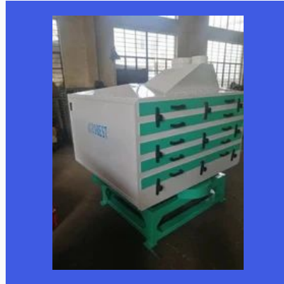
Makhana Grading Machine