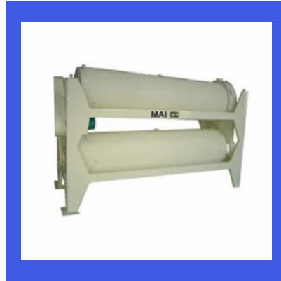
Indented Cylinder Separator