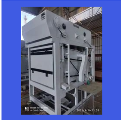
Seed Pre Cleaner Machine