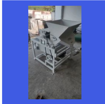
Mini Rice Cleaning Machines