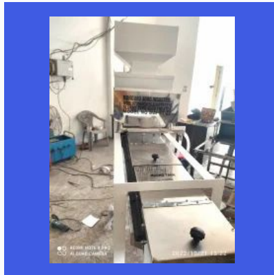
Liquid Seed Treater