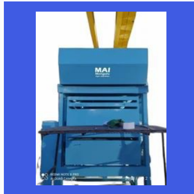
Pulse Cleaning Machine