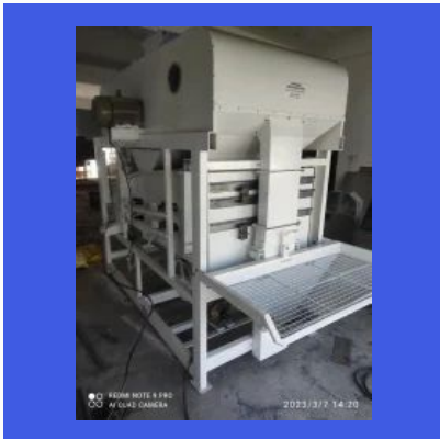
Pneumatic Seed Cleaning Machine