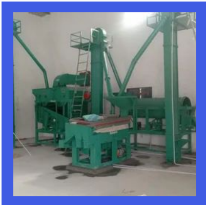
Grain Processing Machines