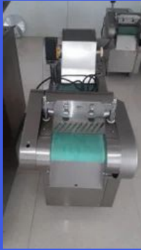
Raw Mango Cutting Machine