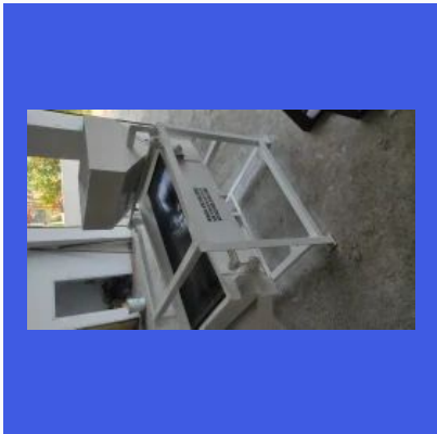
Small Food Grains Processing Machine