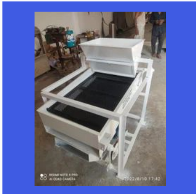
Grain Grading Machine