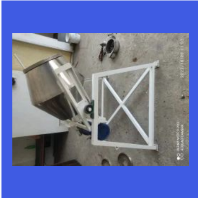
Masala Mixing Mixer