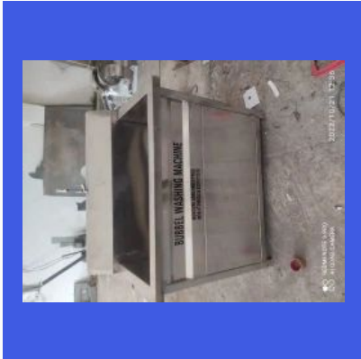
Vegetable Bubble Washing Machine