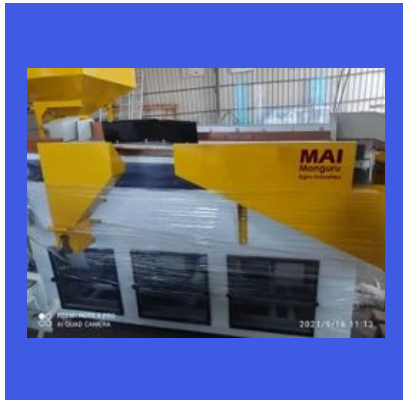
5 Fan Gravity Separator Machine