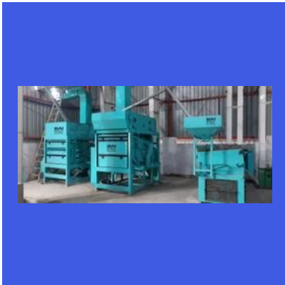
Wheat Cleaning Plant