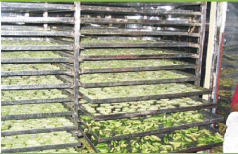
Solar tunnel dryer