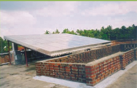
Solar air heater for process heating