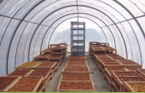
Solar greenhouse dryer

A complete solution in solar drying technology