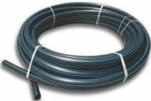
Biogas Pipeline & Fittings – HDPE 1inch, Upto 20m