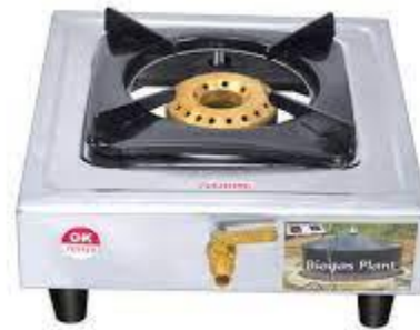
Single Burner Biogas Stove