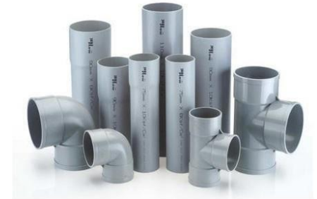
Digester Inlet & Outlet – 4inch PVC pipe with fittings