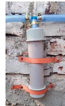
Moisture trap & Pressure Release Valve (PRV)