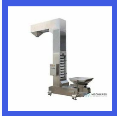
Z Type Bucket Elevator Machine