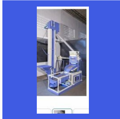
Cigarette Recycling Machine