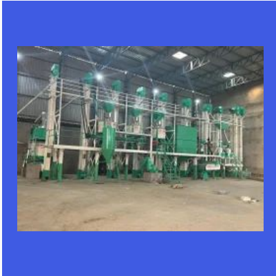
Wheat Cleaning Machine