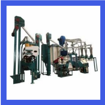
Grain Processing Machines