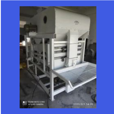
Seed Cleaning Machine