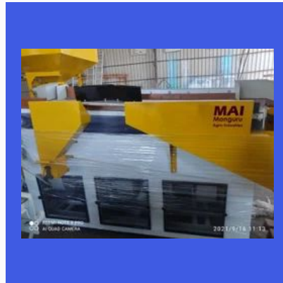
5 Fan Gravity Separator Machine