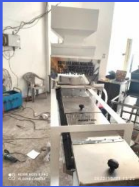
Liquid Seed Treater