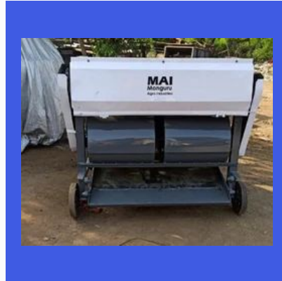
Grain Fine Cleaners