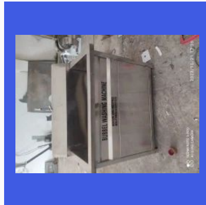
Vegetable Bubble Washing Machine