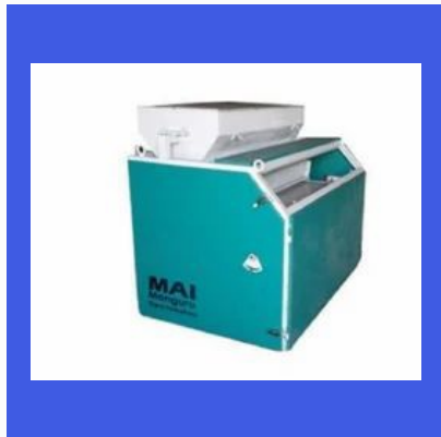
Automatic Destoner Machine