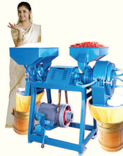
BOH - 4 Ordinary Super Motor Capacity 5 to15 HP