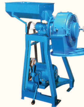
SH - 8 Single Head Heavy Duty Motor Capacity 5 to 15 HP