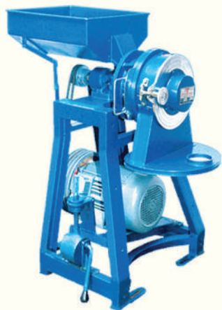
LR - 3 Single Head Motor Capacity 5 to10 HP