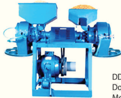
DD - 7 Double Head Deluxe Motor Capacity 7.5 to 20 HP