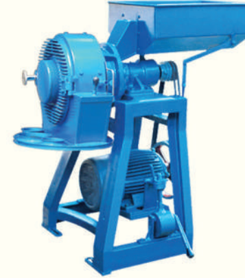
SD - 14 Single Head Deluxe Motor Capacity 7.5 to 20 HP