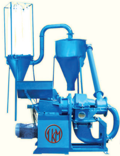
CH - 5 Triple Stage Cyclone Motor Capacity 25 to 30 HP