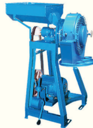
LC - 2 Single Head Motor Capacity 5 to 10 HP