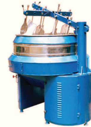
MR - 31 50 -75 Kg Motor Capacity 1 HP