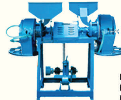
BH - 5 Both Side Heavy Duty Motor Capacity 5 to 15 HP