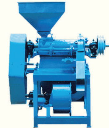
HB - 11 Huller Cum Blower Motor capacity 10 HP