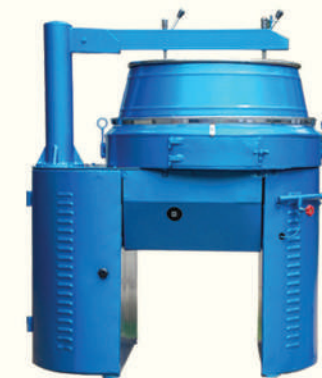
MR - 30 1 - 25 Kg Motor Capacity 0.5 HP